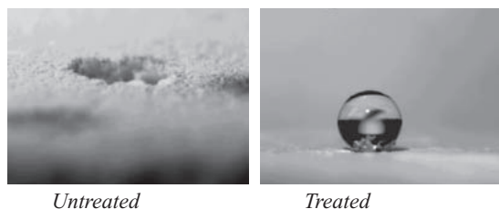
Figure 2: Example of transforming a mineral filler from hydrophilic to hydrophobic with a phenyl-functional silane